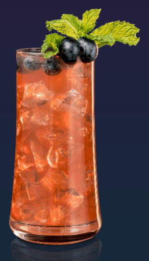
Watermelon-jito Featuring Ciroc Summer Watermelon